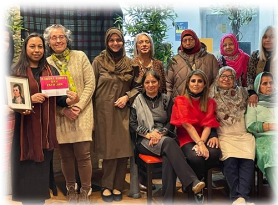
NKS Service Users ~ January 2022.

NKS had also managed to identify volunteers to teach basic conversational English skills to men and women. The English conversation sessions ran for the whole year with more than 15 women and men online.