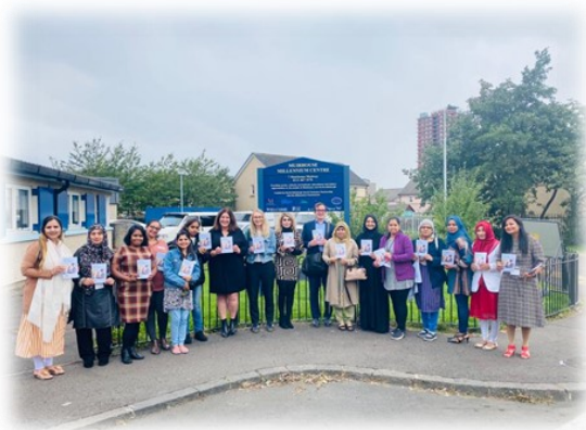
Smart Meters GB Session ~ September 2021.

In conclusion, although last year was a busy period for the organisation, it was an uphill task to shift to a hybrid way of working. Health and safety was of prime importance and it was pertinent to have safety guidelines in place along with masks, screens and sterilising products for staff and service users. The staff team and volunteers had to re-organise themselves to come back to work and provide services face to face. No staff or volunteer remained untouched by the virus due to the nature of the community work. The management of the organisation was always struggling to balance out the service provision with the constant staff shortage. The community lacked confidence to come out and engage with others face to face. A lot of time was spent outreaching and visiting families to understand the challenges faced by them. The post-pandemic survey study was carried out to assess widened inequalities experienced by the marginalised families.