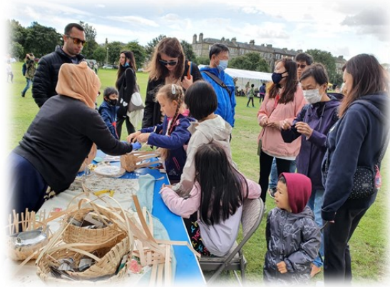
NKS Climate Action Fund Project ~ August 2021.

The Carers' Forum meeting once a month has given a voice to the unpaid carers to share information and learn about their rights as well as services available for carers in Edinburgh. The majority of them have been encouraged and supported to access VOCAL services – a carers' organisation in Edinburgh providing a range of facilities for carers.