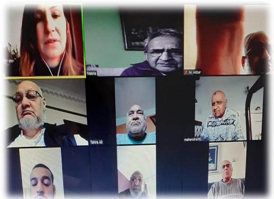
NKS Men's Support Group Dementia Session ~ January 2022.

The highlights of the significant achievements are summarised below: