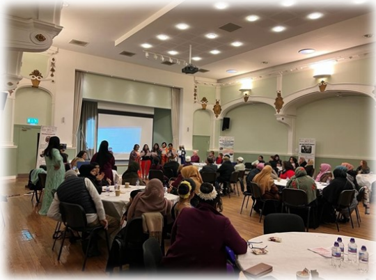
NKS AGM ~ November 2021.

It has been another successful year for Networking Key Services (NKS). There were many challenges as people were still dealing with the aftermath of the pandemic, but NKS continued to grow to serve the community. At NKS the staff tried their utmost to support the service users and to encourage them to return to a normal way of life.