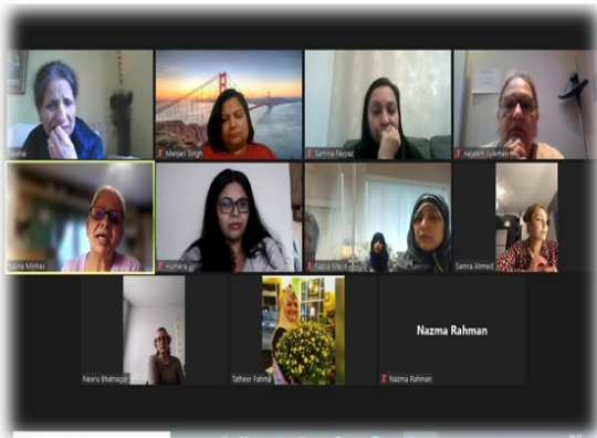
Autism Staff Training ~ January 2022.

South Asian communities is a pressing need. Some of the health conditions such as diabetes, heart disease, arthritis and to some extent cancer are more prevalent in South Asian communities. NKS supported over 100 individuals with long-term health conditions and advocated for their carers last year to access health and welfare services.