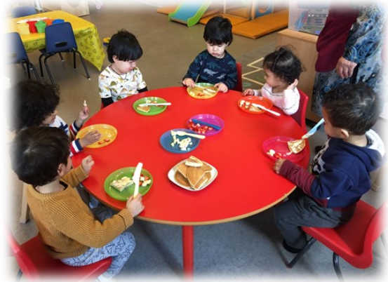
Snack time in NKS Nursery ~ March 2022.

Last year was the final year of the NKS Oral Health Project. The project managed to raise awareness of the importance of good oral hygiene among South Asian families through several innovative activities and information sessions. The emphasis of the project was mainly on early years of children that led to effective interaction with the mothers of young children. Over the three years project a significant gap in dentist services for communities was identified and reported to the funders via our three yearly report.