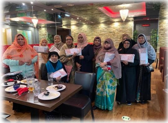
NKS service users Christmas Lunch ~ December 2021.

children attending regularly each week and they are benefitting from the support offered with their studies.